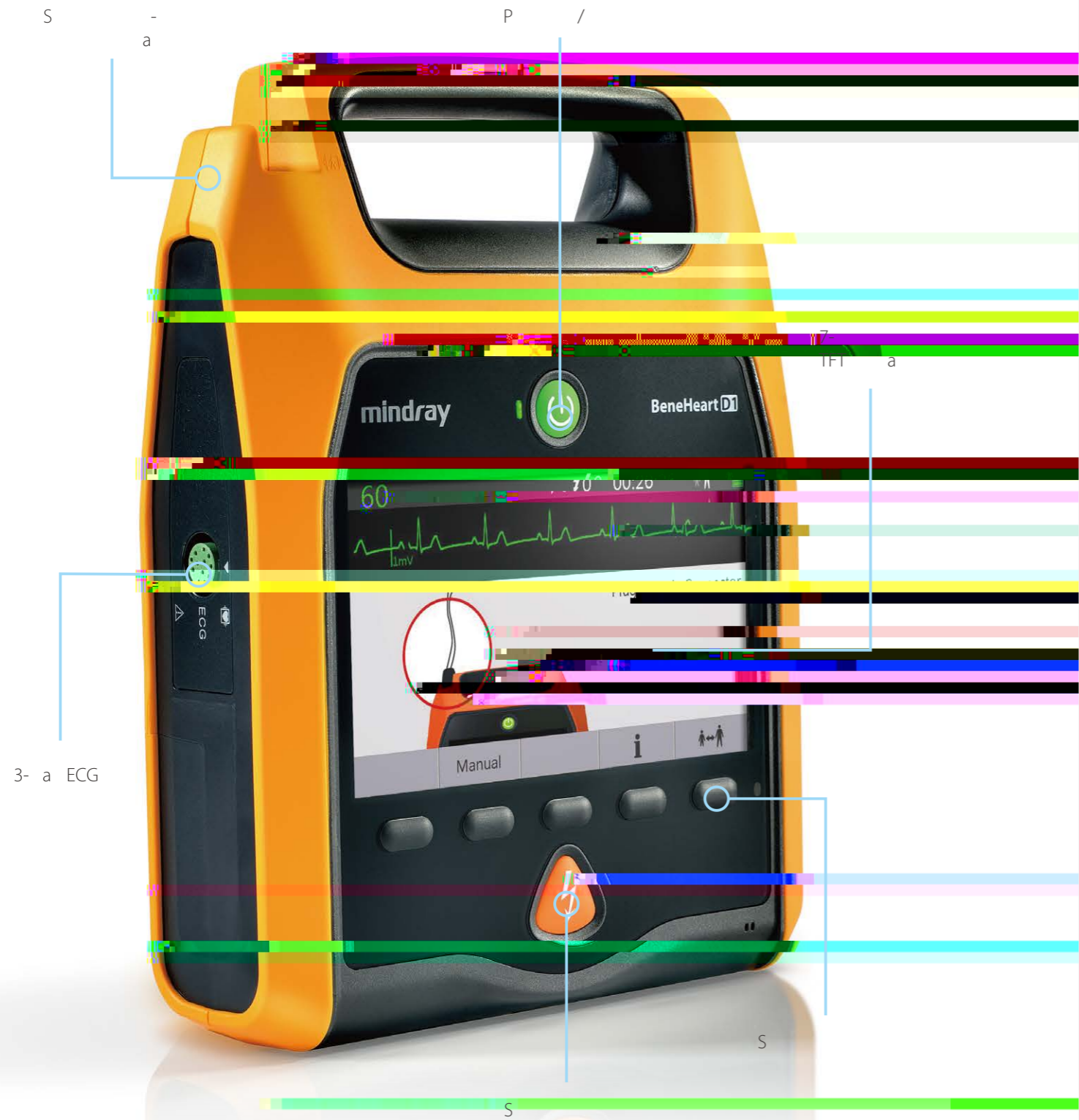
BeneHeart D1 has the high protection level (IP55) against dust and water.