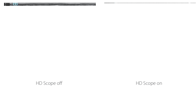
Figure 3: The comparison images of a thyroid mass using HD Scope. The boundary of thyroid mass is much clearer and the inside of the lesion shows more details when HD Scope is switched on.

as shown in Figure 3, the Left image is an original display of a thyroid mass, in which the boundary between the mass and the surrounding normal tissue is not clear, and the internal structure of the mass is not clearly displayed. The right image is the same case in the same plane with HD Scope, in which the boundary between the mass and the surrounding normal tissue becomes much more clearer, and it can be clearly observed that internal structure of mass is not uniform. Overall, the image with HD Scope has much better contrast resolution with more details, and blood vessels around the mass are nicely defined.